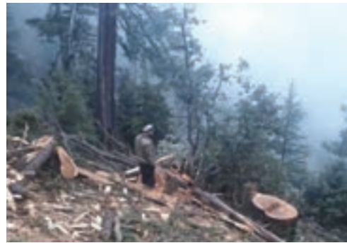
Growing deforestation in Shishi Koh Valley

Chitral district's unique topography makes it highly vulnerable to natural disasters throughout the year, including flash floods, glacial lake outburst floods (GLOFs), avalanches, and landslides . It is home to more than 5,000 glaciers lined by more than 100 mountain peaks over 5,000 meters in the Hindu Kush mountains. The frequency of natural disasters in the area has increased drastically over the past ten years. According to a 2016 report, 20 glacial lakes have formed as a result of runoff from 182 glaciers that are rapidly melting. This poses a critical threat to human settlements and infrastructure in the form of GLOFs.