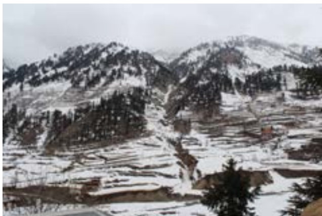
A view of Dinar's village blanketed with snow