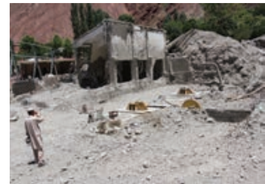
Landslides as a result of deforestation

My research study was completed as part of my master's degree titled "Causes and Consequences of Deforestation in Shishi Koh Valley District Lower Chitral." I decided to focus on deforestation because most of the people in my community are unaware about the importance of forests. I saw an urgent need to ensure the community was informed about how illicit cutting of forests brings disasters in the form of flooding, soil erosion, landslide, avalanches, GLOFs, and more.