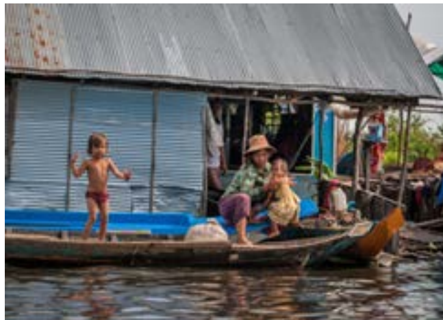
Sankae district, Cambodia, is prone to flash floods.

commune and adopting methods to mitigate them. I am grateful for the opportunity to have learned new skills and engage with other stakeholders, and believe this experience was vital to helping me perform my duties to the commune as mandated by the law.