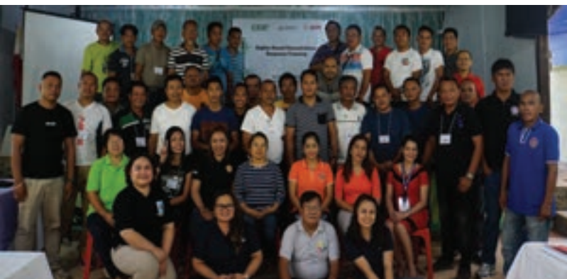
Participants at the Rights-Based Training

Today 804 schools in our division implement this activity with voluntary pupil participation.