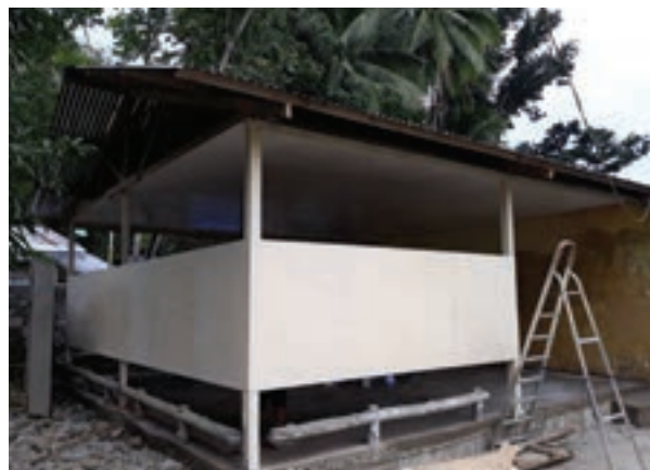
Temporary Learning Spaces in construction, facilitated by DepEd

As a Project Development Officer, my primary responsibilities include providing psychosocial training to guidance counselors, guidance advocates, teachers and school nurses. At first, I was overwhelmed at this task because the level of knowledge was so low. My office also offers Temporary Learning Spaces (TLS) for children affected by disasters, which made me understand the importance of learning continuity in children's development.