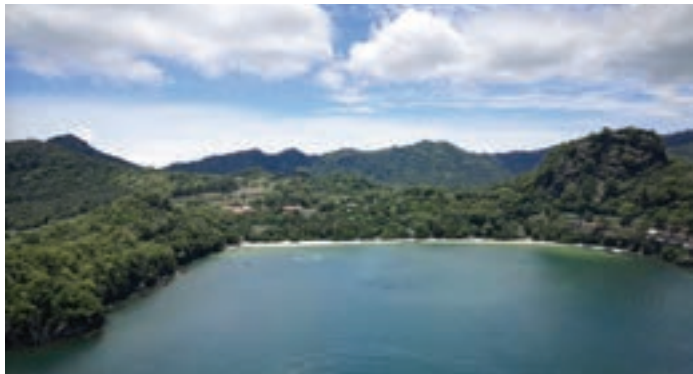
A view of Dipolog City