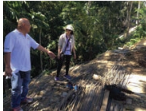
Checking the repair, rehabilitation and construction integrity of school buildings

Dipolog City is prone to floods, landslides , and minor earthquakes but public funds are limited for training the community in disaster preparedness. As a result, residents including teachers do not even have basic knowledge of disaster preparedness, which makes particularly vulnerable in times of disaster and after.