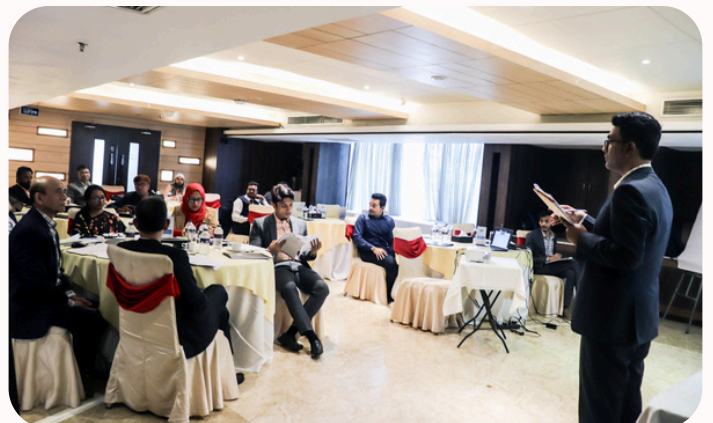
Meeting with a community women's group as part of a baseline survey to understand their challenges in disaster preparedness and gather insights (left), and researchers presenting proposals to the Technical Committee for feedback and review (right).