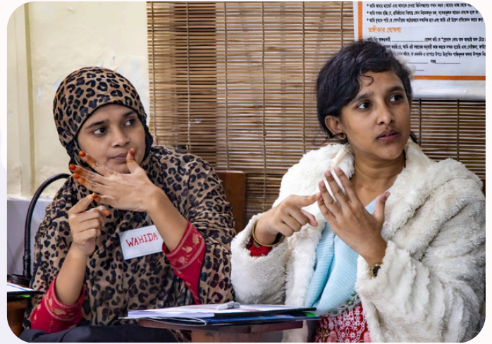
Participants practicing sign language and essential techniques for communicating with individuals with hearing and speech disabilities during the training

BPP recently held a series of "Disability Inclusive Search, Rescue, and Evacuation (DISRE)" trainings to ensure persons with disabilities are included in disaster risk reduction. The program covered their unique vulnerabilities, barriers to inclusion, and strategies for participation in search, rescue, and evacuation. Aligned with the principle of "Leave No One Behind," the training emphasized women's participation, empowering them to take active roles in disaster preparedness. Read more